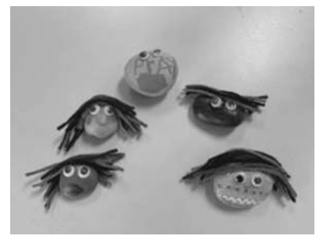
Learning of how Daniel prayed three times a day, we are reminded of these verses from Luke 19:37-40.

When he came near the place where the road goes down the Mount of Olives, the whole crowd of disciples began joyfully to praise God in loud voices for all the miracles they had seen: