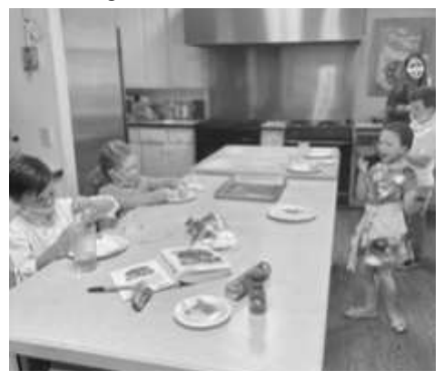
Making resurrection rolls