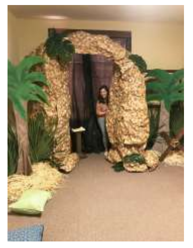
Children's Chapel fun!