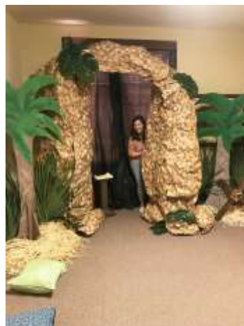
Children's Chapel fun!