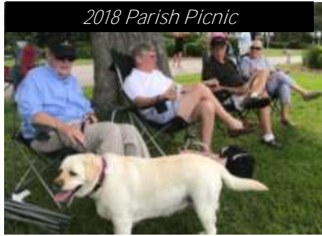
2018 Parish Picnic