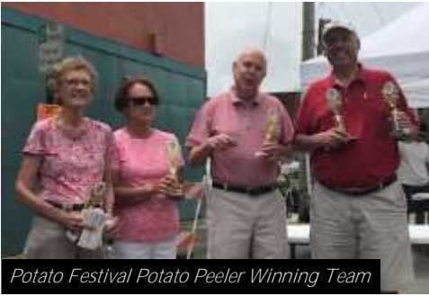
Potato Festival Potato Peeler Winning Team